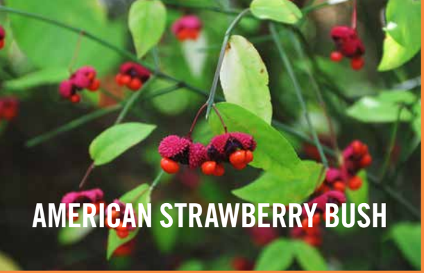
AMERICAN STRAWBERRY BUSH