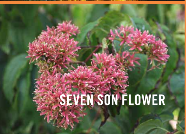
SEVEN SON FLOWER